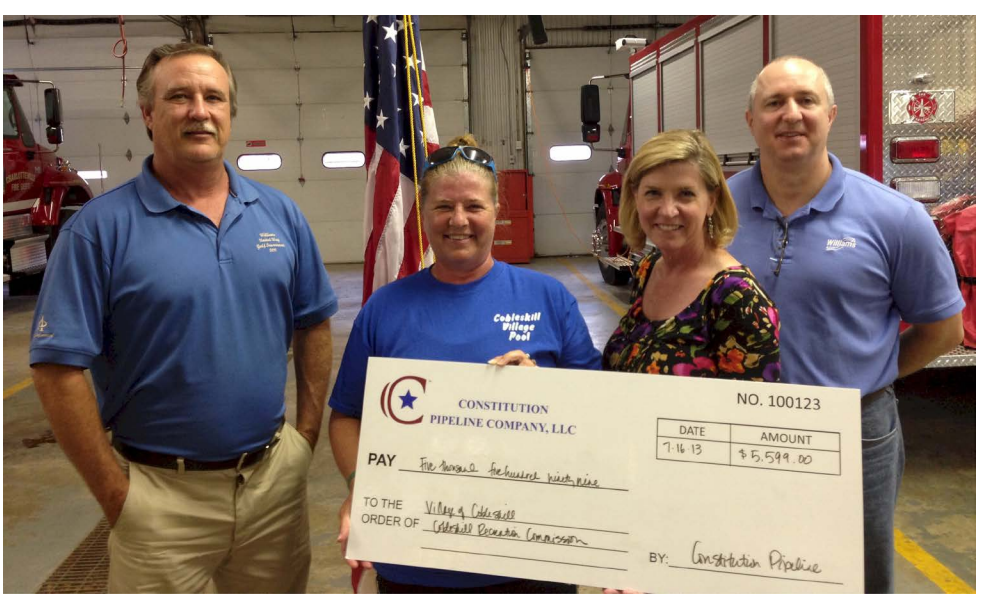
Constitution Pipeline representatives present a check to the Cobleskill Recreation Commission.

The mission of the Constitution Pipeline Community Grant Program is to identify and help fund noteworthy projects that directly benefit the surrounding communities.